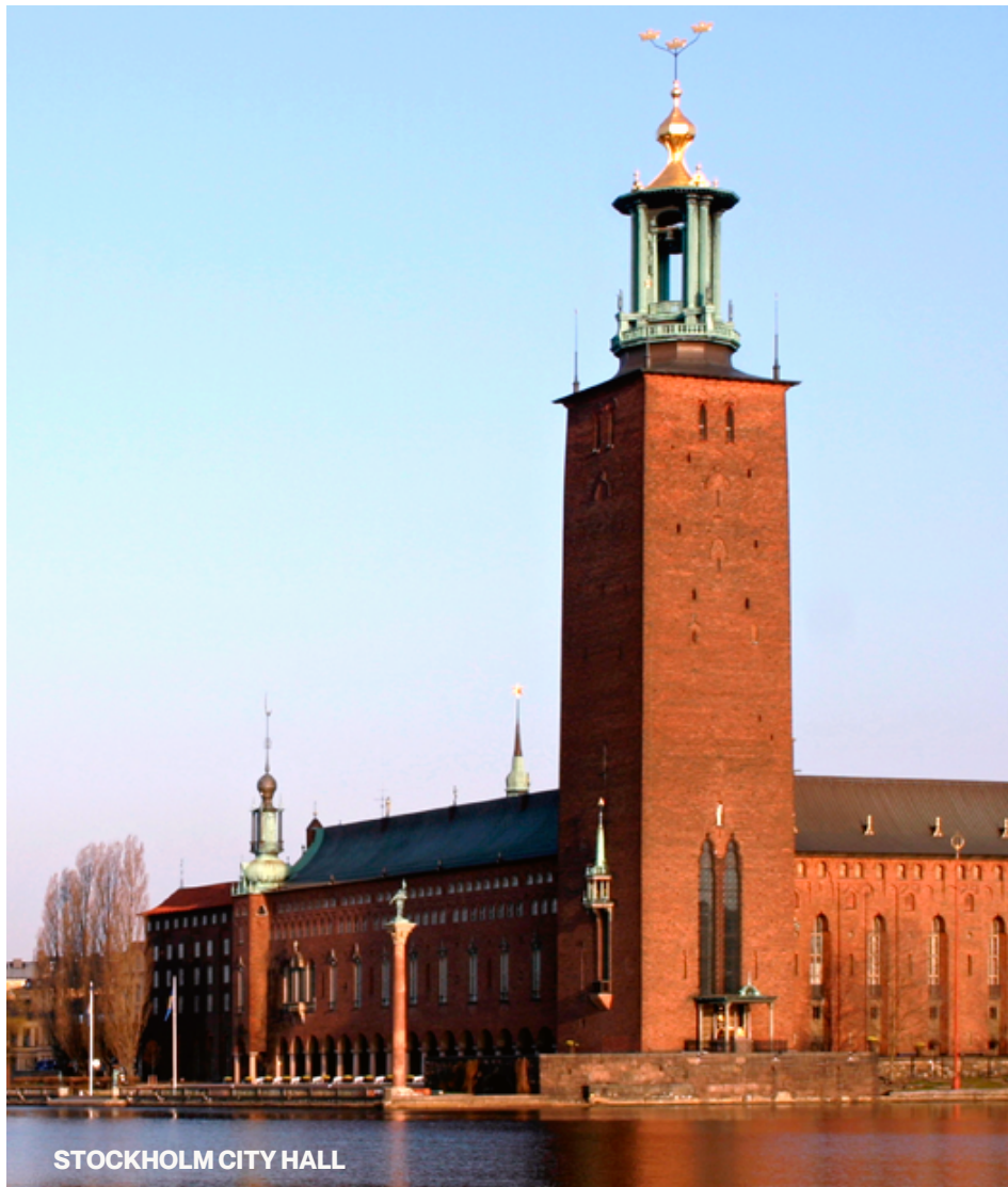
STOCKHOLM CITY HALL

Tiba di Lapangan Terbang Antarabangsa Kuala Lumpur (KLIA1).