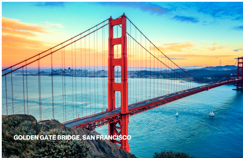
GOLDEN GATE BRIDGE, SAN FRANCISCO