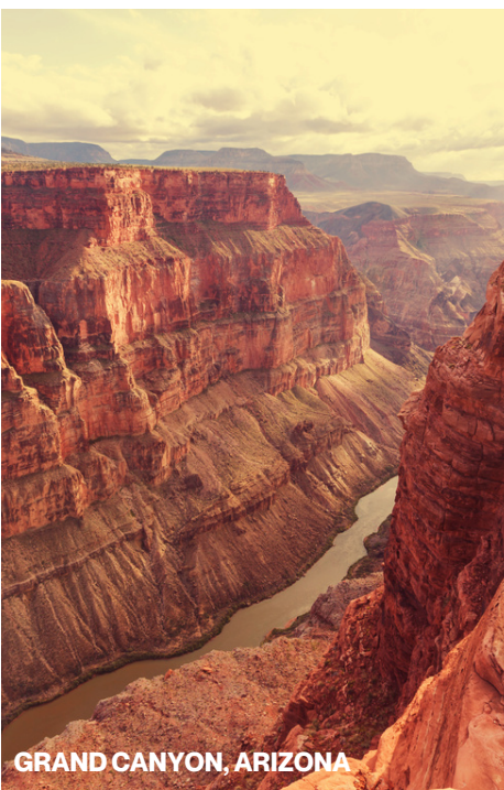
GRAND CANYON, ARIZONA

Tiba di Lapangan Terbang Antarabangsa Kuala Lumpur (KLIA).