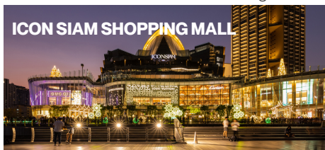
ICON SIAM SHOPPING MALL

Makan malam di restoran tempatan dan daftar masuk hotel. Bermalam di Bangkok.